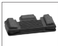
Foot Control 210